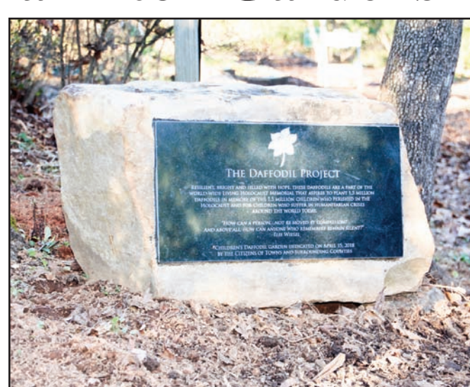
The Daffodil Project at the Hamilton Gardens has been relocated to the interior of the rhododendron and azalea gar

The pair's tenure ended about six years ago when the Hamilton Gardens at Lake came clear that the Hamilton